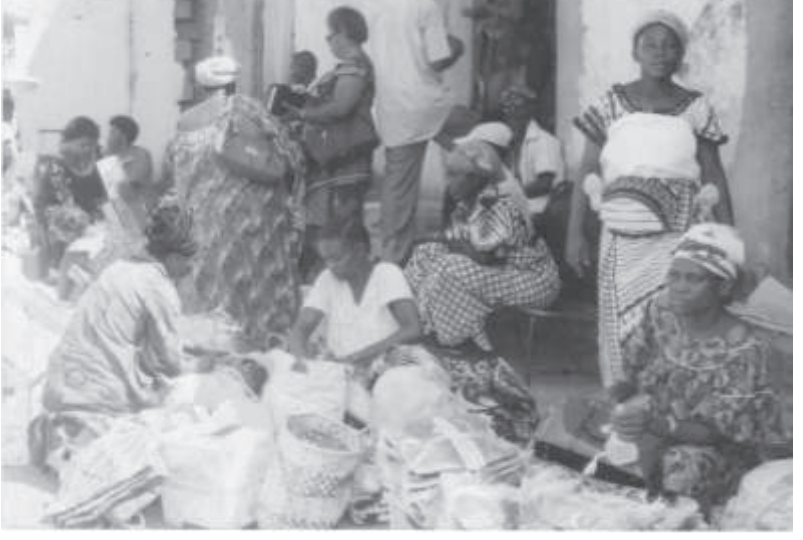
Head loaders in Kivu gather to organise to stop the corruption of border officials and for their economic rights

frontier, risking harassment from the border police and others who sometimes make her pay a bribe. She delivers it to an informal trader in Burundi, who only pays for the goods received. Anything lost on the route is considered her responsibility. When there are many police roadblocks in Burundi, after crossing the border, she divides her load into three or more smaller