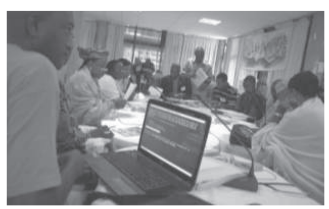
StreetNet International delegates to the International congress participate in the Congress Commissions