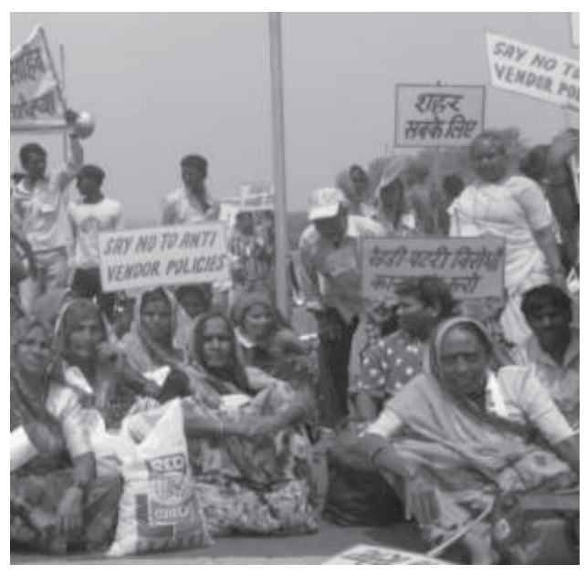
Street vendors in Delhi demand an end to antivending policies

"During the South Africa World Cup, street vendors clearly lost out as they were excluded and evicted from trading sites. The same approach is being taken in New Delhi. Let's hope that when the World Cup arrives in Brazil, the urban poor do not also live in fear for their livelihoods but finally have something to celebrate!", Pat Horn, StreetNet International's Coordinator, concluded.