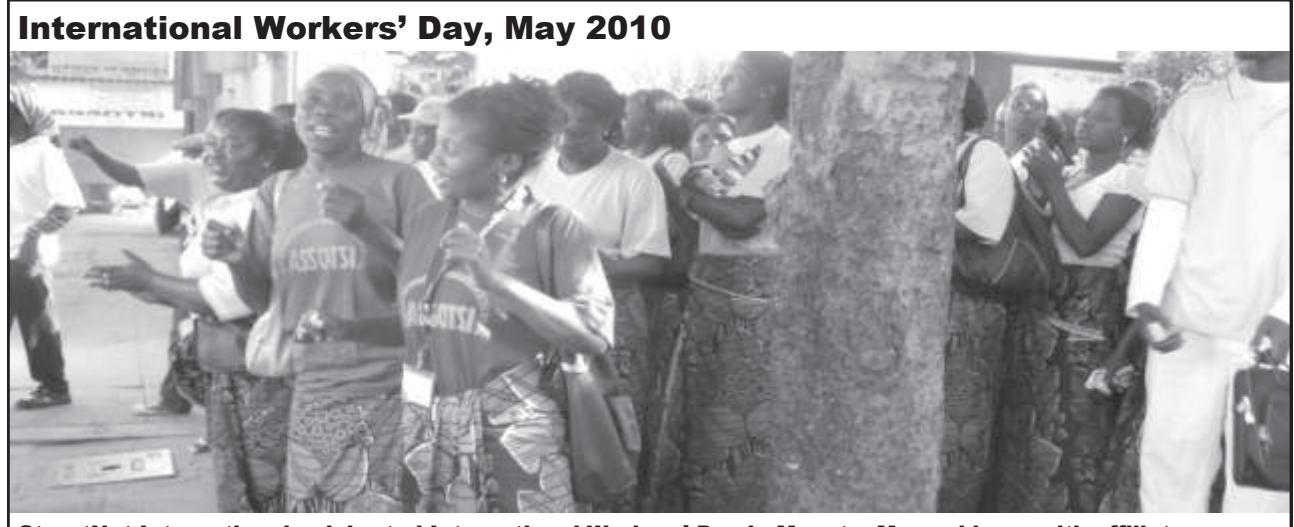
StreetNet International celebrated International Workers' Day in Maputo, Mozambique, with affiliate ASSOTSI who hosted the StreetNet International Council meeting and the WCCA Campaign Workshop held from 3rd-7th May, 2010

A new approach is now being developed (similar to that of the Ghana TUC since its 1993 Congress) of all federations and unions affiliated to UNTA being encouraged to seek out informal economy workers in their sectors and organise them – either directly or indirectly through small groups before integrating them into their structures – in Benguela, Cabinda, Cuando Cubango, Huambo and Luanda.