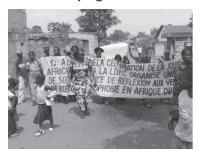
LDFC, DRC, holds a march in solidarity with street vendors in South Africa