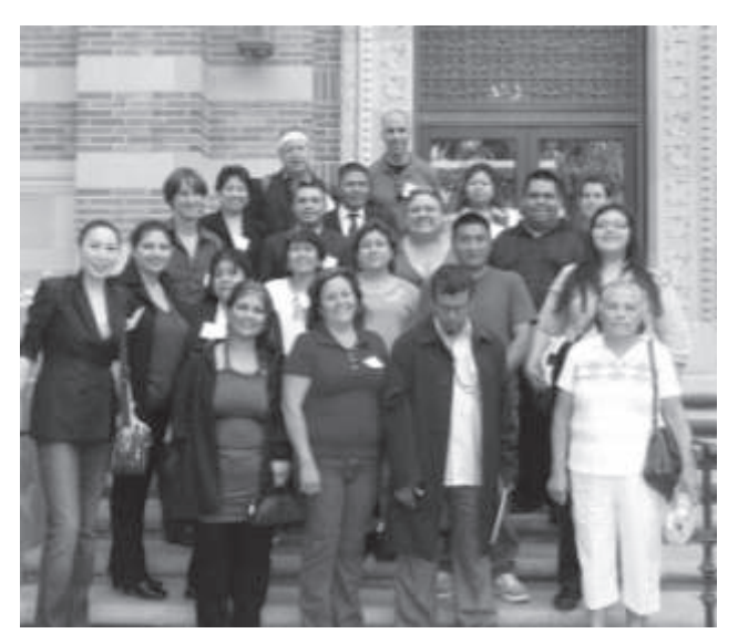
Delegates at the street vendors meeting held in Los Angeles at the end of the first day

Federación de Organizaciones de Trabajadores y Trabajadoras del Sector Social e Informal de la Economía de Honduras (FOTSSIEH) developed the first workshop of 2010 on Women, Gender and Democracy, with the support of StreetNet. The workshop was attended by 42 members from different regions who learnt about the importance of women's leadership in the Federation. They had two days to discuss different topics and succeeded in raising self-esteem, developing high level of