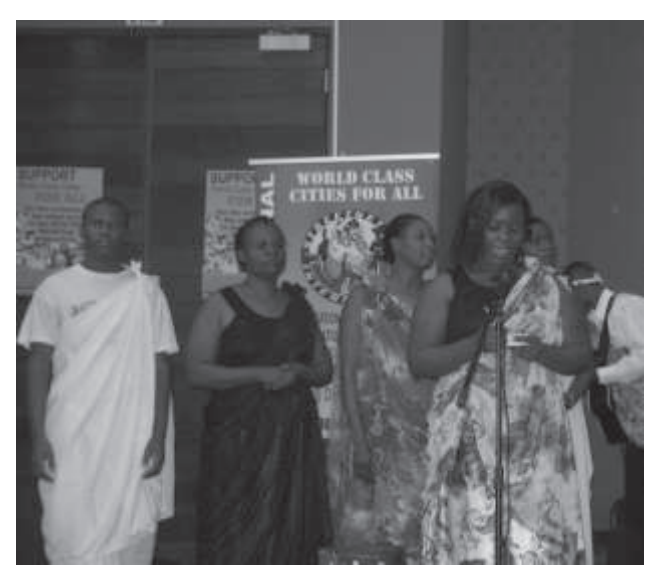
The Africa Day meeting held by the WCCA Campaign in Durban, South Africa, was concluded with Rwand -ese Burundian traditional dance by a group from the Union of Refugee Women