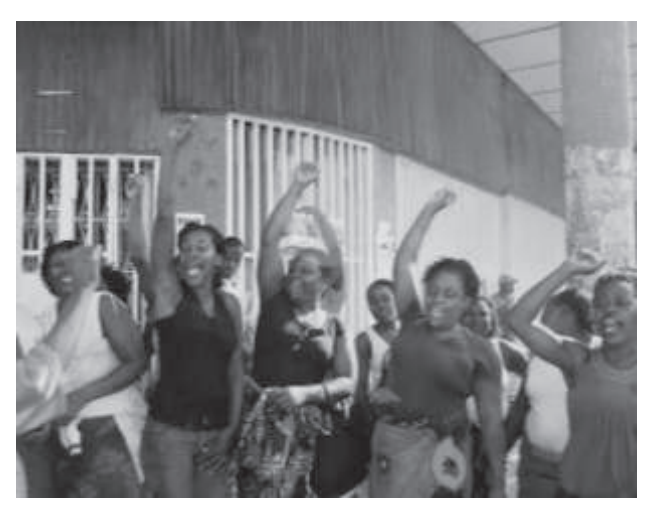
Solidarity by market traders in Maputo, Mozambique during the WCCA Campaign Workshop, 6th-7th May