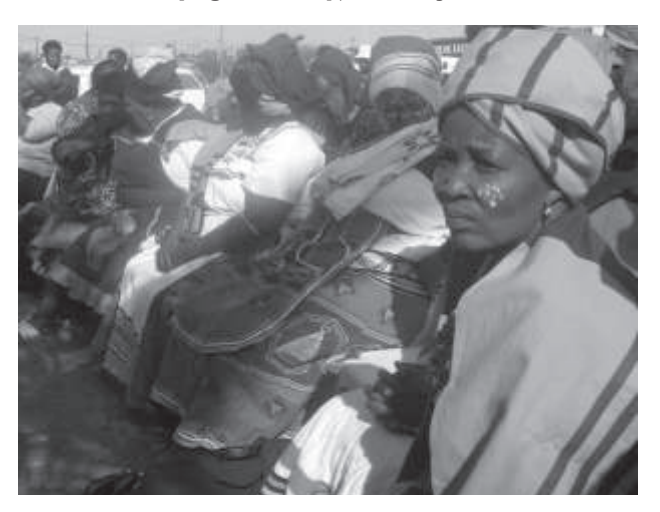
Informal traders at the Africa Day celebration meeting held by the WCCA Campaign in Port Elizabeth, South Africa