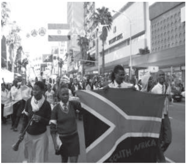
The WCCA Campaign marched with members of the Durban Social Forum to protest on June 16th, South Africa Youth Day, against the extravagance of the FIFA World Cup and the exclusion of the urban poor