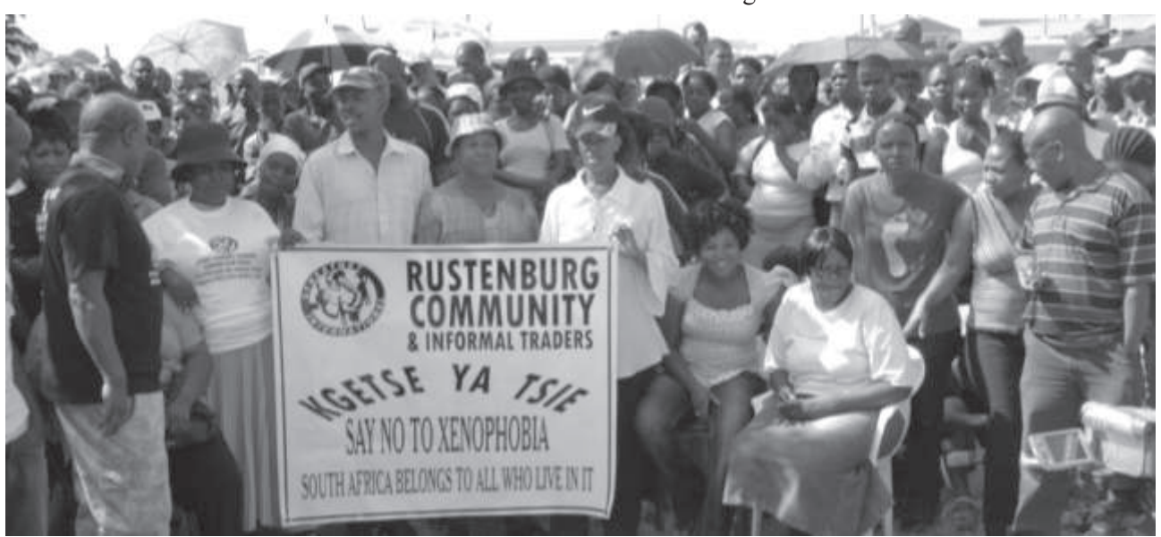
Rustenburg informal traders under Kgetse Ya Tsie gathered to protest eviction prior to the World Cup by the Host City and to give support to Xenophobia- Free Games

The participation at the workshops varied between 30-110 participants and in all events, the South African Municipal Workers Union (SAMWU) collaborated together with migrant workers' organisations.